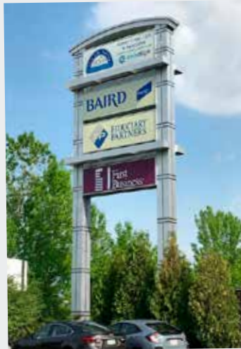
Signage facing I-41