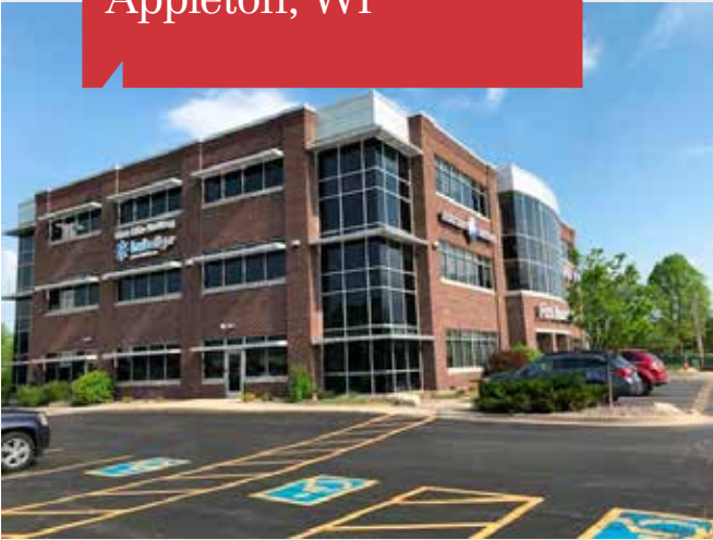
Ample parking (81 paved parking stalls and 10 visitor stalls). Signage on building.

For Sale 3913 W. Prospect Ave. Appleton, WI