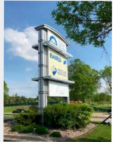
Signage facing W. Prospect Ave.