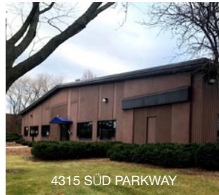
4315 SÜD PARKWAY