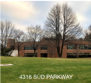
4316 SÜD PARKWAY